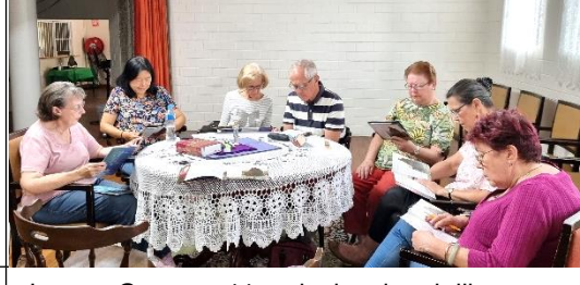
Lenten Group at 11am in the church library on Fridays throughout Lent.