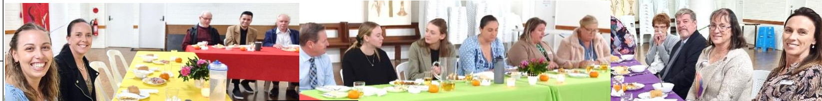
Photos from the celebration of the Sacrament of Confirmation last Sunday

St. Joseph's Como cares for safeguarding children. Safeguarding Office at (02) 9390 5810 or safeguardingenquiries@sydneycatholic.org .