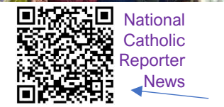
National Catholic Reporter News