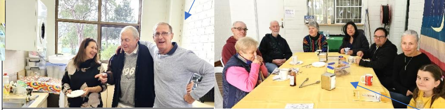
Every Sunday after 8am Mass there is cuppa in the lobby of the hall.

Dear Pilgrims, welcome back from World Youth Day.