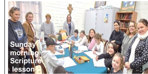
Sunday morning Scripture lesson

First Holy Communion will take place on the 17 th Sept. at 11am and 2pm Masses. Seventy-three Candidates from the six Primary Schools will joyfully receive Eucharistic Jesus on that day. We are indebted to our Teachers, Catechists and Parents for their outstanding role in preparatory work for this memorable coming day.