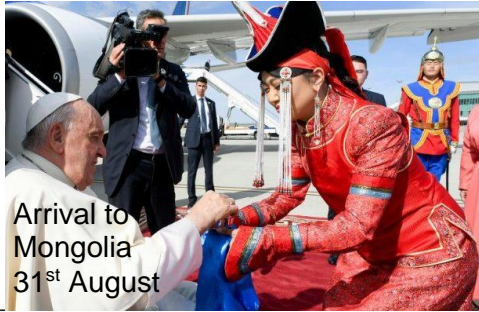
Arrival to Mongolia 31 st August

HTTPS://WWW.BPOINT.COM.AU/PAY/CO-MOOYSTERBAYPARISH