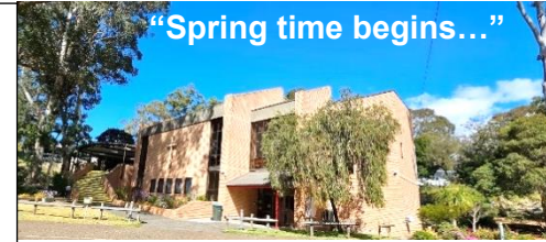
"Spring time begins..."

As is customary in his Apostolic Journeys, on his way to the Mongolian capital, Ulaanbaatar (means Red Hero), Pope Francis wired greetings to the leaders of each country he flew over, including President Xi Jinping of the People's Republic of China. In his message, the Pope said: "I send greetings of good wishes to Your Excellency and the people of China as I pass through your country's airspace on route to Mongolia. Assuring you of my prayers for the wellbeing of the nation, I invoke upon all of you the divine blessings of unity and peace." (EWTN)